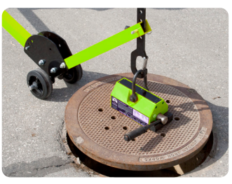
See Special Utility Applications Lifters in IMI's 101z Catalog

Vertical Lift Adaptor featuring two PowerLift® magnets, designed to lift ferrous metal from horizontal to vertical orientation or vise versa. Adjustable for various widths, thicknesses and shapes. Ask for a PowerLift Tech Sheet for specifications.